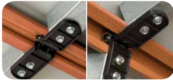
STRONG AND QUIET HINGES

For Colour options refer to the colour range page